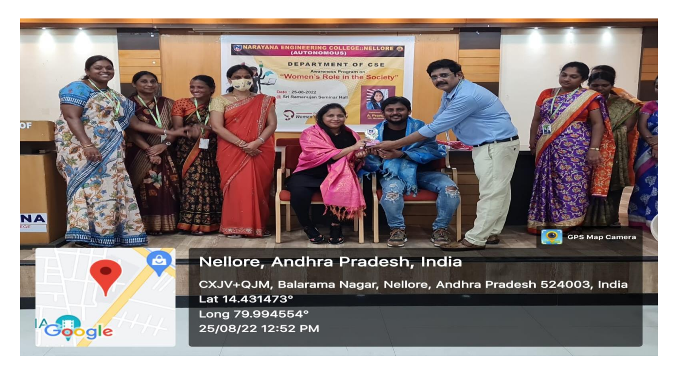
Felicitations the Resource Person By HOD of CSE, Staff &Students with Momento.